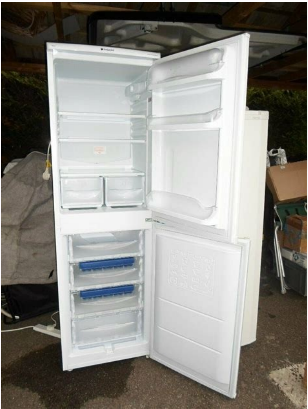
Hotpoint iced diamond freezer settings. Hotpoint iced diamond fridge settings.